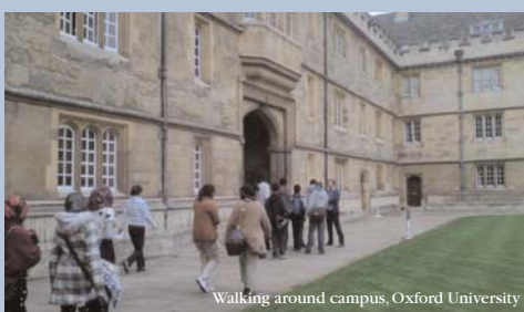
Walking around campus, Oxford University

After that we were given a tour of Wadham's College grounds including its Junior Common room and gardens. We were told the gardens consisted of trees that biology students had grown after realizing that they were not extinct and we learnt that most of the trees weren't even originally from England as the central tree was from Persia. We also discovered that the gardens were