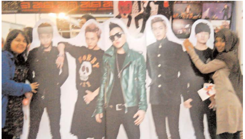
Nazim 11A and Co. showing off their dance moves at World Skills! Help them win the Arbesko Facebook competition by liking them at Arbesko Facebook/97 Cass Pirates