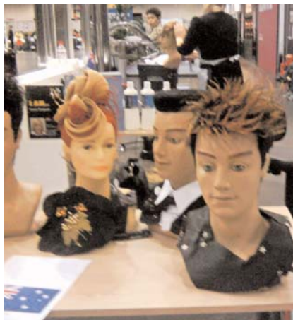
Just a few of the hairstyles the competitors created.